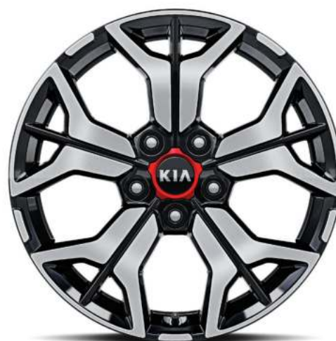
18" Alloy LTD

Two-tone colours are available at additional cost.