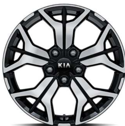
17" Alloy EX