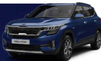
Dark Ocean Blue