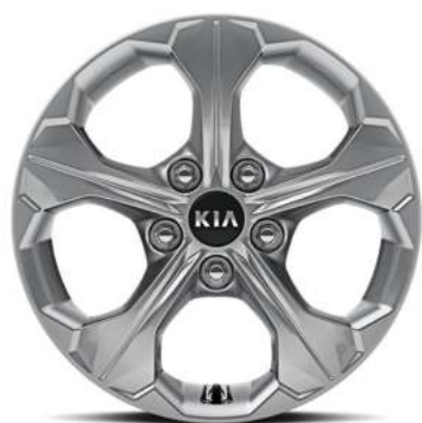
16" Alloy LX and LX PLUS